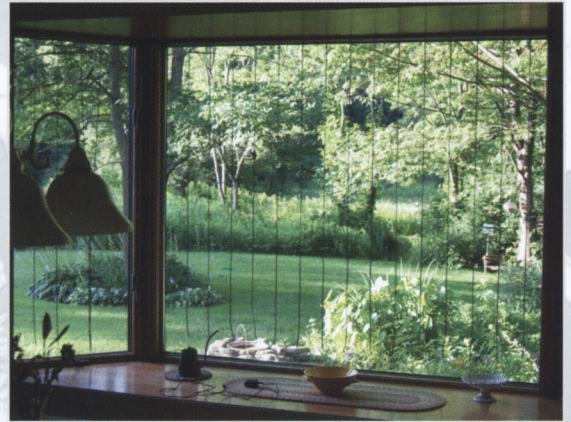
Acopian BirdSavers™