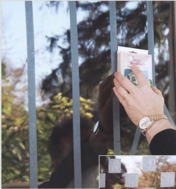
ABC BirdTape (Squares/Stripes) | Dariusz Zdziebkowski

>> Find more information, product links and examples at mn.audubon.org/birdsafe-homes